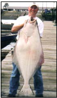
Client with a 75 lb Halibut he caught while fishing near Tillamook, Oregon.

All of these opportunities are within two hours drive of the Portland Vancouver area.