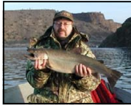
Fish for trophy lake trout, Oregon & Washington.

Since 1998 A & B Pro Guides Referral Service (ABPG) has helped thousands of clients hook up with the most action-packed fishing adventures ever. Providing some of the highest success rates in the industry.