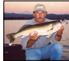
Trophy Columbia River Walleye are pursued by only a hand full of experienced guides. Let us direct you the best of the best.

All of our guides are licensed and registered with the US Coastguard. They are also trained in CPR and first aid and have many years of experience.