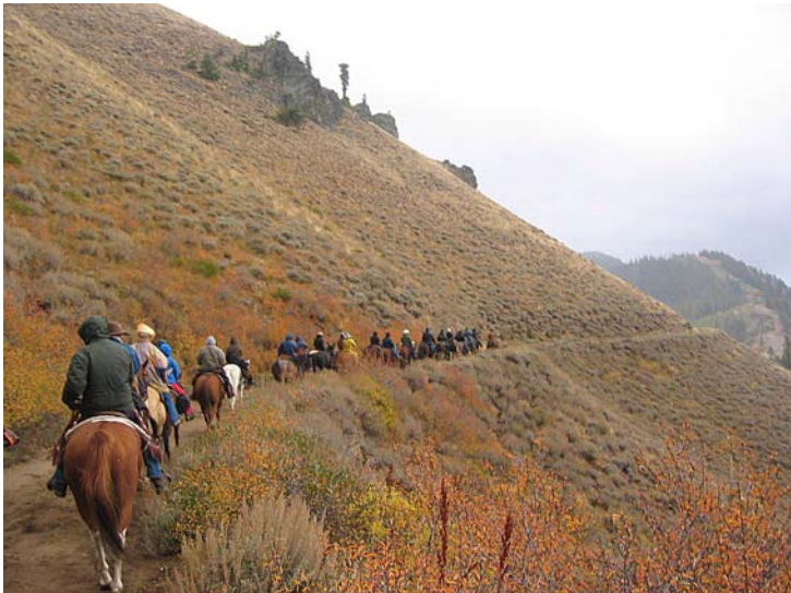
Oct. 2008

We look forward to riding with each of you. Please don't hesitate to give us a call: